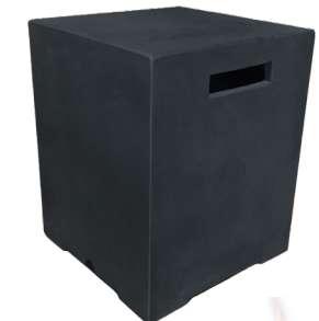
Propane tank cover/side table or seat Fiberglass reinforced cast concrete