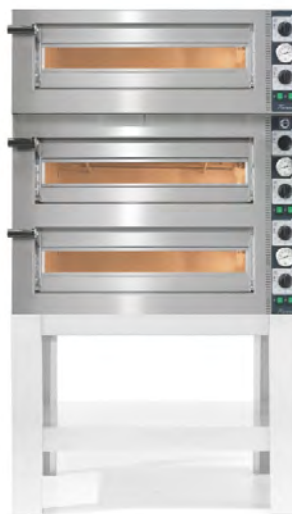
CP435/1 + CP435/2