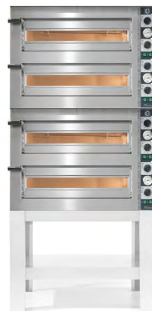
CP435/2 + CP435/2