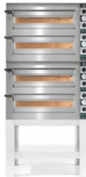
CP430/2 + CP430/2