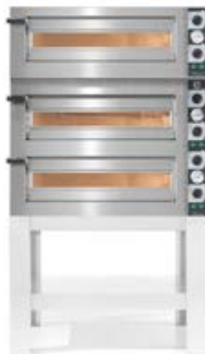
CP430/1 + CP430/2