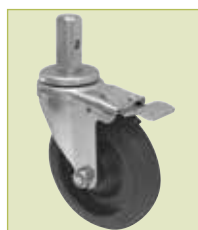
ALRC-5STK 5" caster with brake